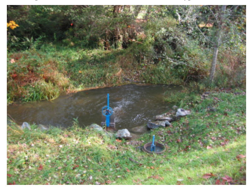
Figure 1 600mm Intake Valve and 300mm Bypass Valve

Week one saw the installation of a 300mm dia. PVC by pass pipeline 124m long. The pipeline is designed to take water from the existing 600mm dia. steel pipe and bypass the settling pond for the 2007 construction and any pond maintenance (dredging etc.) in following years. It was attached to a valved WYE in the steel intake line fabricated and constructed in 2006.