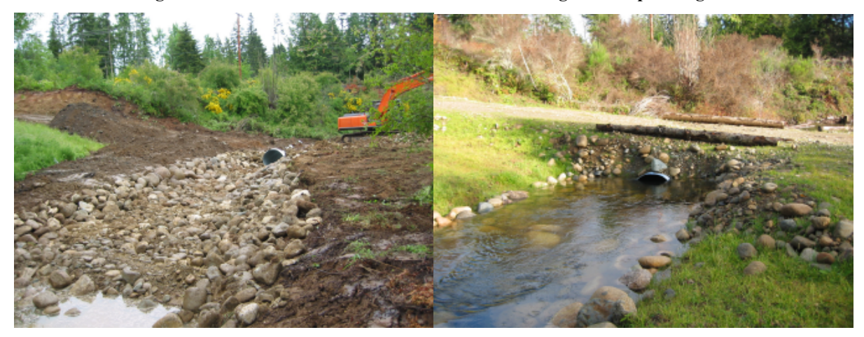
Figure 11 Operating

Week 5 saw our construction roads ballasted as per our agreement with Nanaimo Regional Parks. The settling pond was dredged, and LWD was hauled to the channel from its staging area in an abandoned quarry. Prior to construction, the project had 20 'demo' truck loads of LWD delivered. During construction 5 more 30m<sup>3</sup> 'bin' truck loads were brought in. This wood was in addition to 100 plus trees gifted to the project by BC Hydro from their right of way danger tree clearing program. A Newbury weir near the hatchery was constructed. It backwaters a large area behind the hatchery and provides an intake pool closer to the hatchery than was previously available.