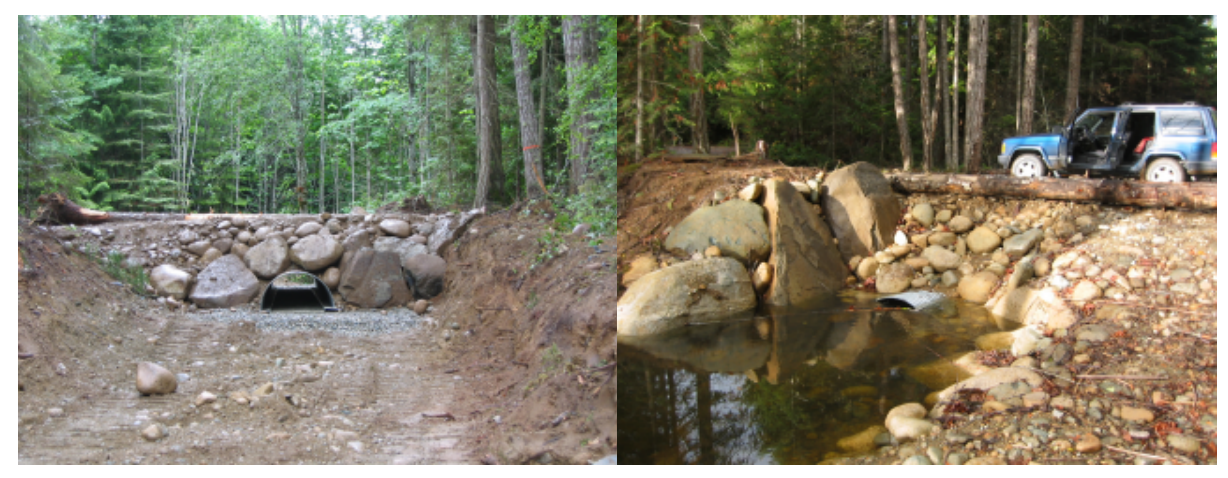
Figure 9 Operating