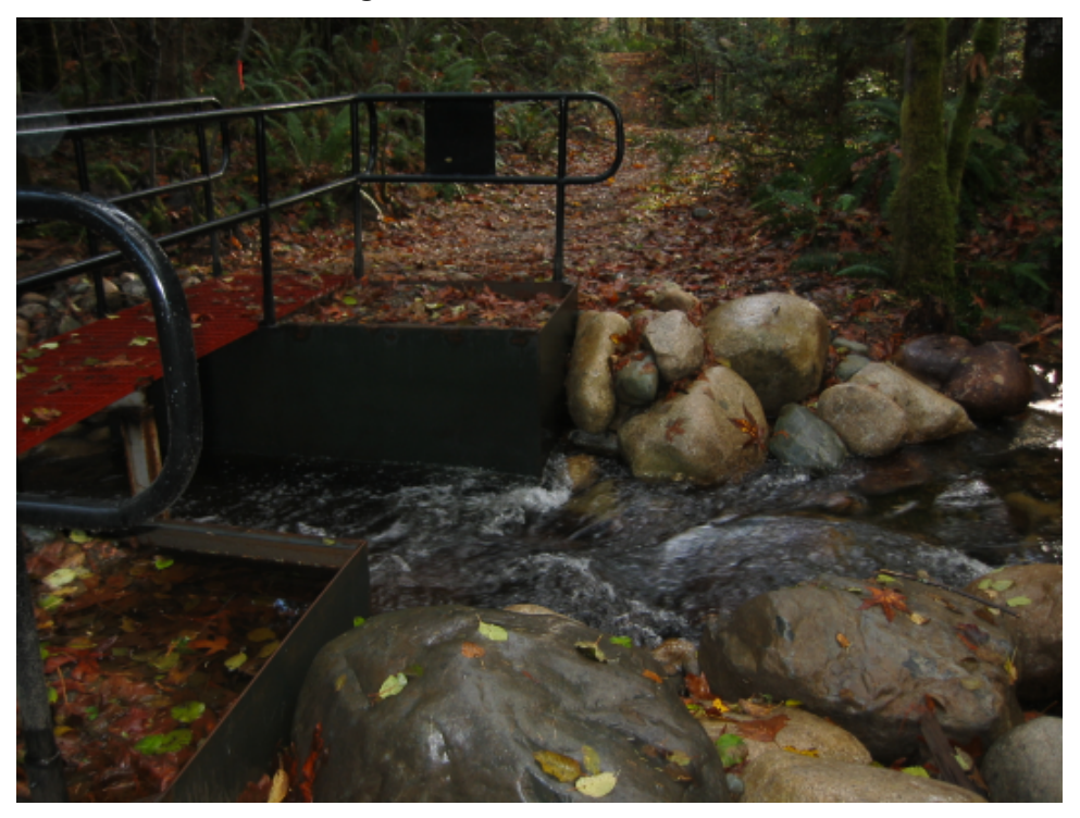
Figure 17 Downstream Fence Sill

Week 7 saw the installation of the sill; construction of a rock groyne in the river to protect the intake site and down stream banks; final LWD installation; and the start of clean up.