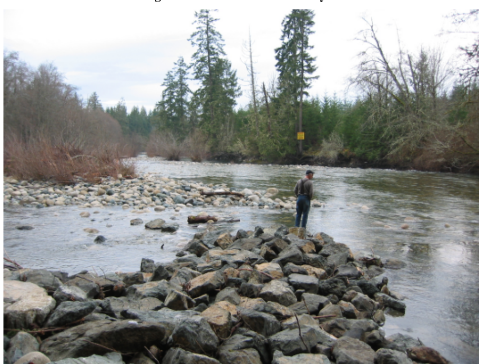
Figure 18 Flood Protection Groyne

Week 7 saw the installation of the sill; construction of a rock groyne in the river to protect the intake site and down stream banks; final LWD installation; and the start of clean up.