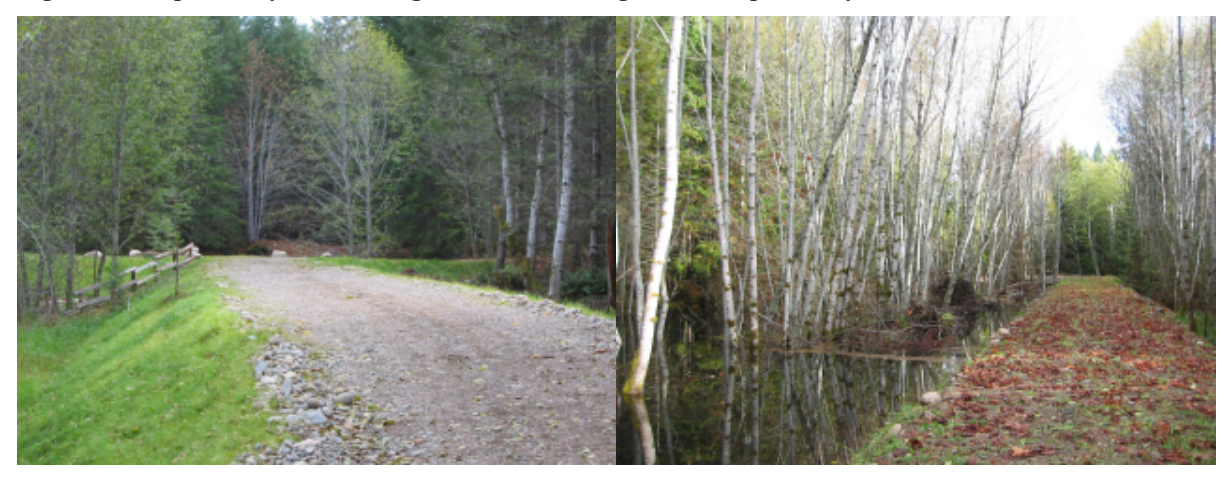
Figure 7 Completed Dyke - Beaver Pond

Week 4 saw the delivery of three 1.2m span x 0.6m rise x 12m long mini span bridges and one 3m x 1.2m dia. culvert. Two of the mini spans and the culverts were set on a bed of 50mm minus gravel, to double as a structural base and potential spawning area, and installed. The channel crossing over the Terasen Gas Pipeline was also completed. Terasen had personnel on site to monitor the work. The crossing was armoured with cobble to protect against any erosion near the pipeline. Some LWD installation and riffle construction was done, and the metal work for the concrete Intake structure was installed.