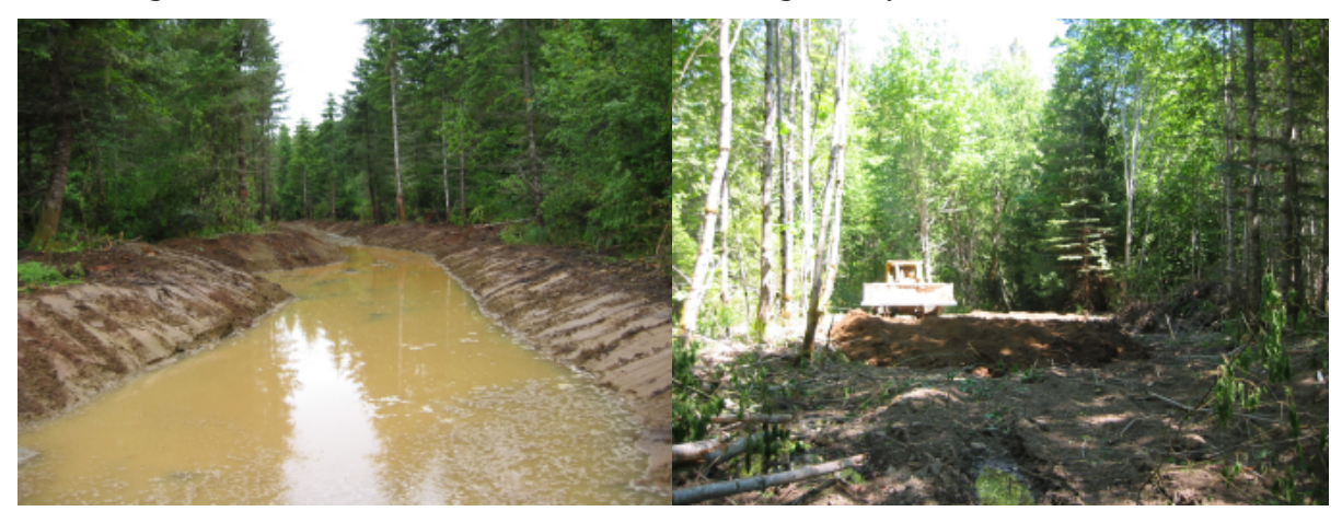
Figure 5 Dyke Construction